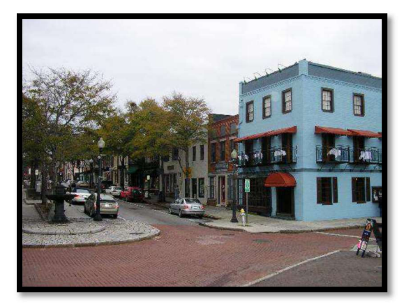
Wilmington, NC (USA)

The intention of the online classroom was to build a collaborative lesson in which students use the photographs of local buildings/structures to determine their surface area and volume.