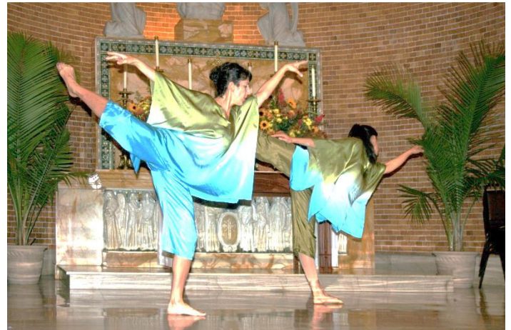
Forward Motion Dance Company

Sister Cities is deeply grateful to everyone who participated in the 2014 Peace through Music Concert for donating their time and talent using the universal language of music, song and dance to promote peace.