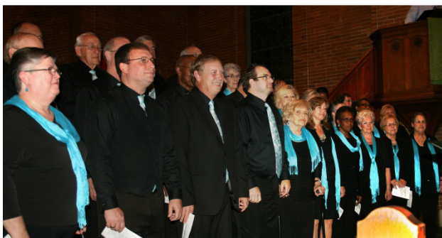
Wilmington Celebration Choir