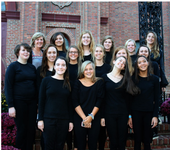
PVUMC Glow Hand Mimes