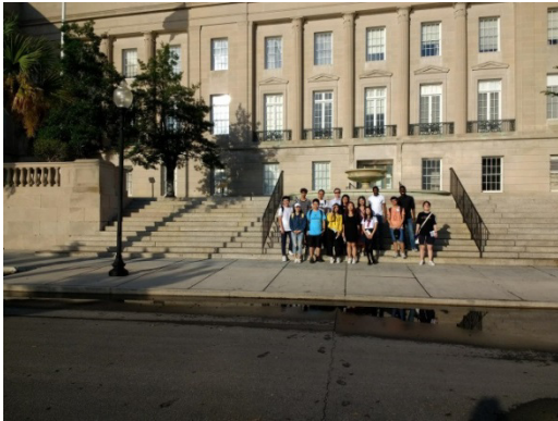
Fudan University & UWI students at Federal Court House