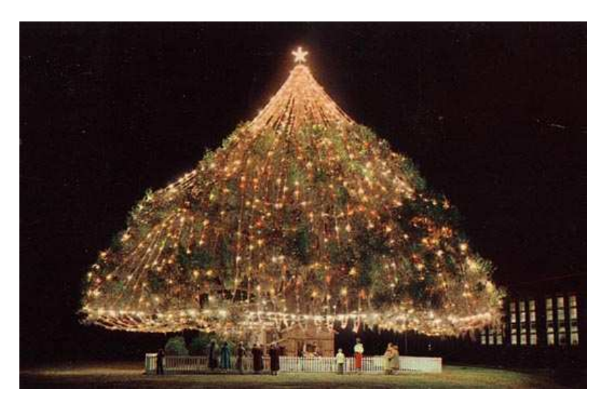
World's oldest live oak Wilmington NC adorned with lights Christmas 2009

Other annual holiday events include the Old Wilmington by Candlelight Tour of historic homes, churches and sites in Wilmington's historic district, the North Carolina Holiday Flotilla, a lighted boat parade that concludes with fireworks on the Intercoastal Waterway in Wrightsville Beach, and the recently developed Mayfaire Town Center organizes a musical celebration with Santa's helpers, a lively parade and even simulated snowfall to everyone's delight.